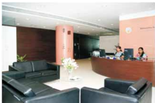
MKCL Office at ICC ‘A’ Wing