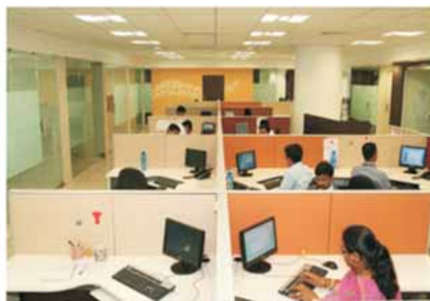
MKCL Office at ICC ‘B’ Wing